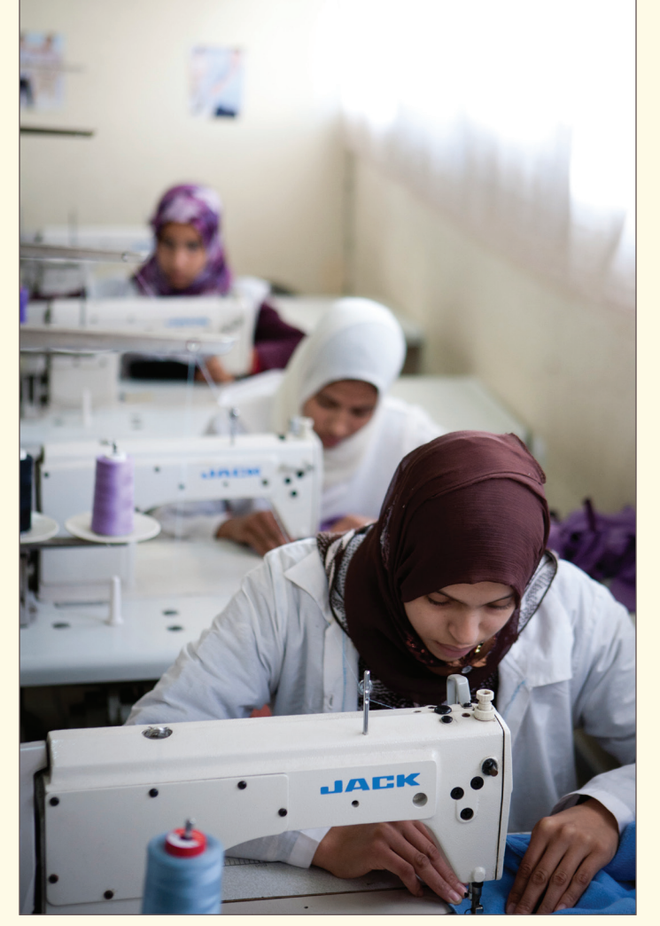
Students learn sewing skills at the Center for Deaf and Hard of Hearing Children in Morocco.

The project focused on four areas: 1) improving the capacity of vocational inclusion services to