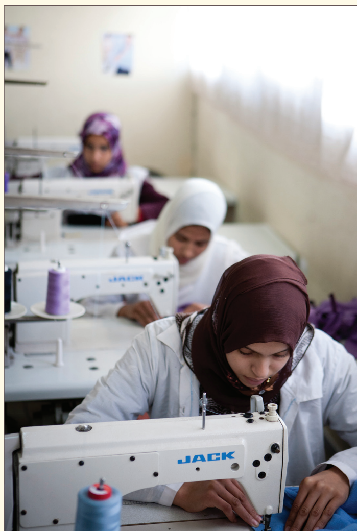
Students learn sewing skills at the Center for Deaf and Hard of Hearing Children in Morocco.

The project focused on four areas: 1) improving the capacity of vocational inclusion services to